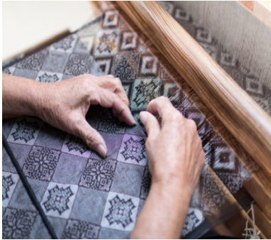
Day 13 Saturday 7 FEBRUARY