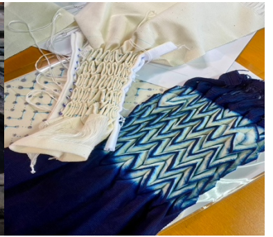
Day 7 Sunday 1 FEBRUARY