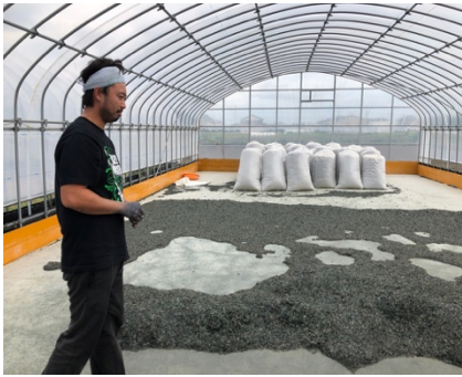
Day 3 Wednesday 28 JANUARY