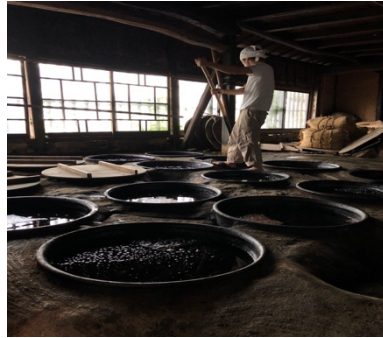
Day 14 Sunday 8 FEBRUARY