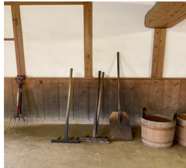
Day 4 Thursday 29 JANUARY