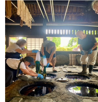
Day 16 Tuesday 10 FEBRUARY