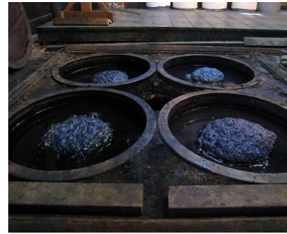
Day 6 Saturday 31 JANUARY