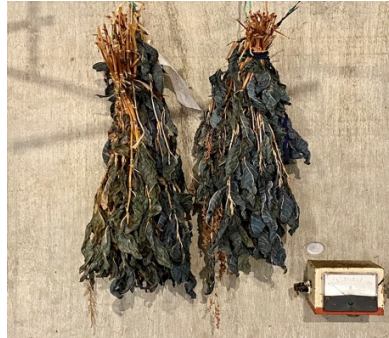
Day 15 Monday 9 FEBRUARY