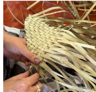
Day 11 Wednesday 8 July