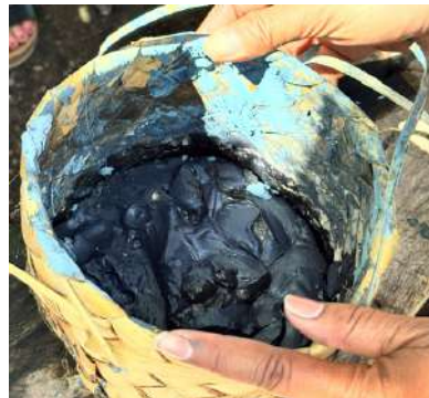
Day 10 Tuesday 7 July