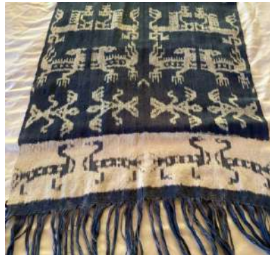
Day 9 Monday 6 July