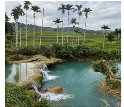
Day 12 Thursday 9 July