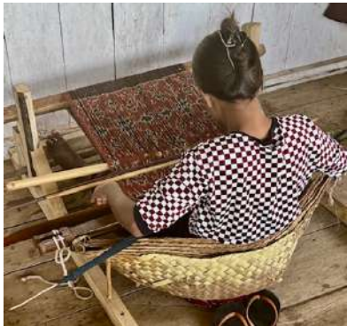
Day 8 Sunday 5 July