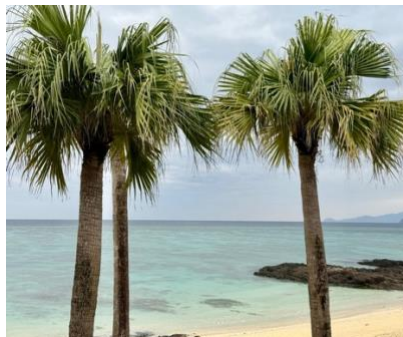
Day 15 Monday