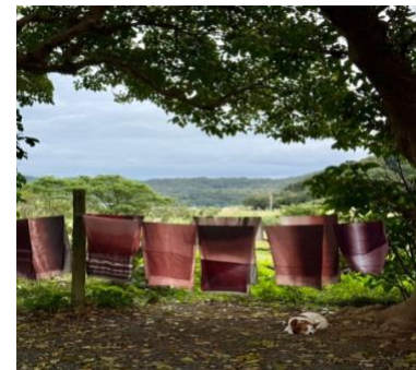
Day 12 Friday