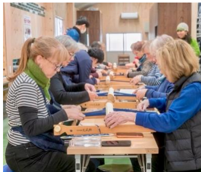
Day 10 Wednesday