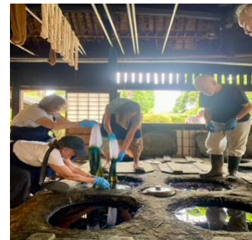
Day 16 Tuesday