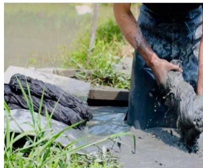
Day 14 Sunday