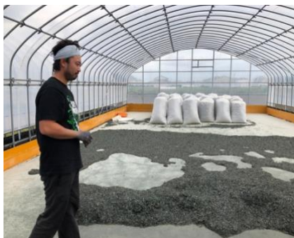
Day 3 Wednesday