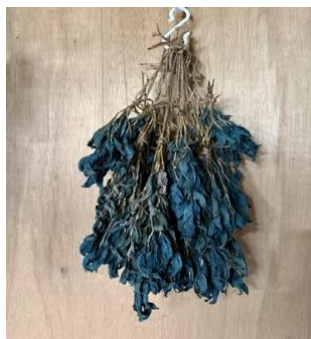
Day 5 Friday