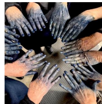
Day 6 Saturday