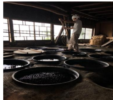
Day 11 Thursday