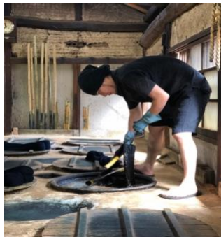
Day 9 Tuesday