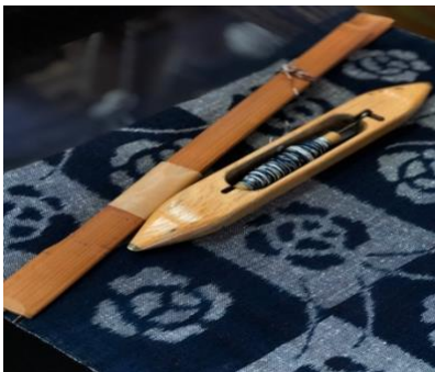
Day 8 Monday