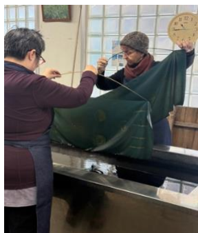
Day 4 Thursday