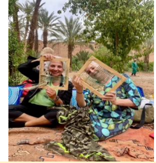
Day 8 Wednesday