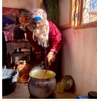
Day 6 Monday