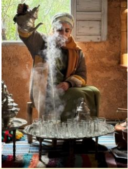
Day 4 Saturday