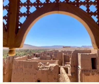
Day 7 Tuesday