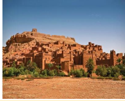
Day 5 Sunday